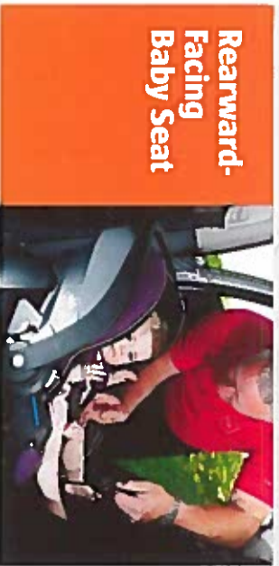
Rearward-facing Baby Seat