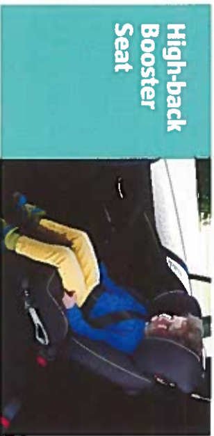
High-back Booster Seat