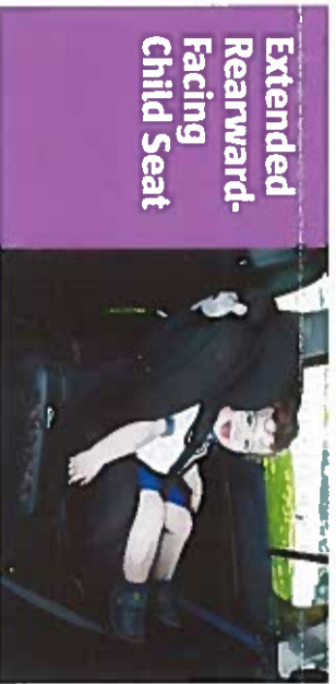
Extended Rearward-facing Child Seat