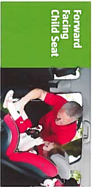
Forward Facing Child Seat